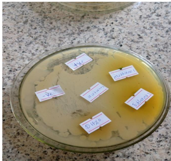
Figure 1: Antimicrobial Activity result of Glinus Lotoides and Croton macrostachyus respectively.

This result was supported by the previous study reported the extracts of Glinus lotoides and Croton macrostachyus exhibited significant antibacterial activity against both Gram-positive and Gram-negative bacteria. Ethanolic and methanolic extracts showed the highest inhibition zones, suggesting strong antimicrobial efficacy (Abdelfatah et al., 2021). The MIC values ranged from 50-200 µg/mL, demonstrating the potential use of these plants as natural antibacterial agents (Razack et al., 2020).