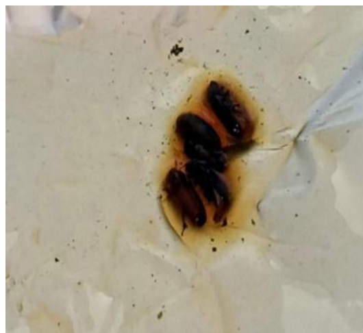
Figure 5: Methanol extracted Croton macrostachyeus test.

As it indicated below ethanol extract of glinus lotoides (Metere) has highest yield and antiweevils activity than that of Croton macrostachyeus extracted. Also when it compared with other extracted yield from glinus lotoides