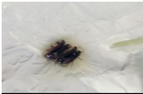
Figure 2: Ethanol extracted Croton macrostachyeus .

The result of anti-weevils activity showed that the seed of Metere ( Glinus Lotoides ) are more effective than leaf of Bissana ( Croton macrostachyeus ).