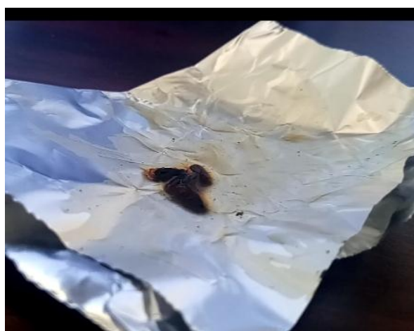
Figure 4: Methanol extracted Glinus lotoides test.