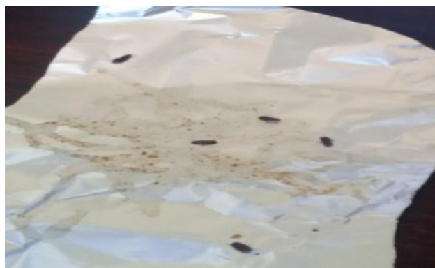
Figure 3: Distilled water extracted Croton macrostachyeus .